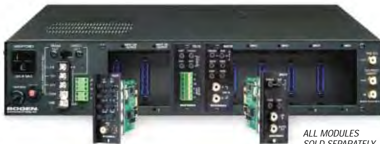
ALL MODULES SOLD SEPARATELY

Input Modules & Signal-Processing Output Modules See Page 23