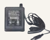
PRS40C Power Supply (12V)