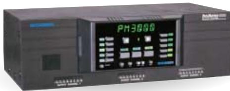
Digitally Matrixed Pre-Amp PM3000