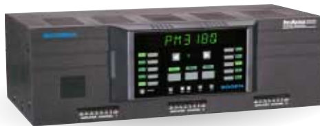
Digitally Matrixed Amplifier PM3180

The Pro-Matrix products were developed expressly for the needs of restaurants, lounges, fitness centers and other venues that require numerous input sources but have areas with distinctly different audio requirements. The Pro-Matrix products provide 3 fully independent audio channels that can use any of the 6 different inputs in vastly different ways. The Pro-Matrix units are designed to be as easy for users to operate as a home stereo yet provide the installer a wide array of customizable features that are all password-protected from tampering.