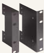
RPK79 Rack Mounting Kit

Technical Specifications, Dimensions, and Weights can be found on Page 67